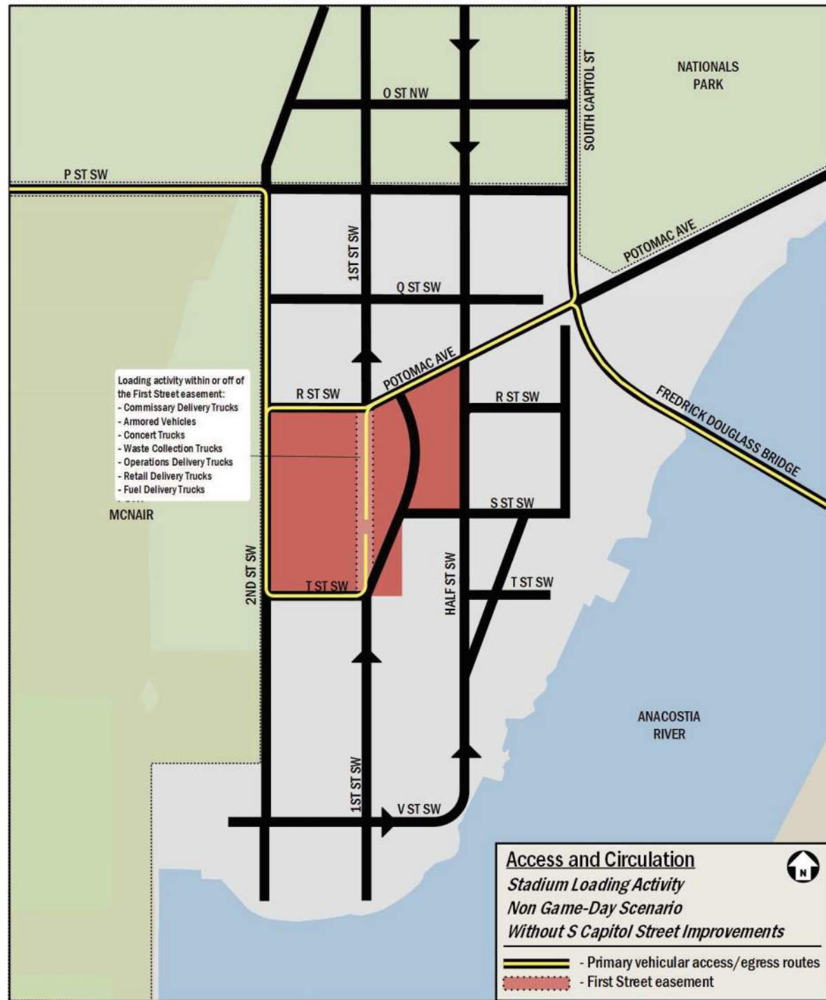
Figure 3: Access and Circulation for Stadium Loading Activity (without South Capitol Street Oval)